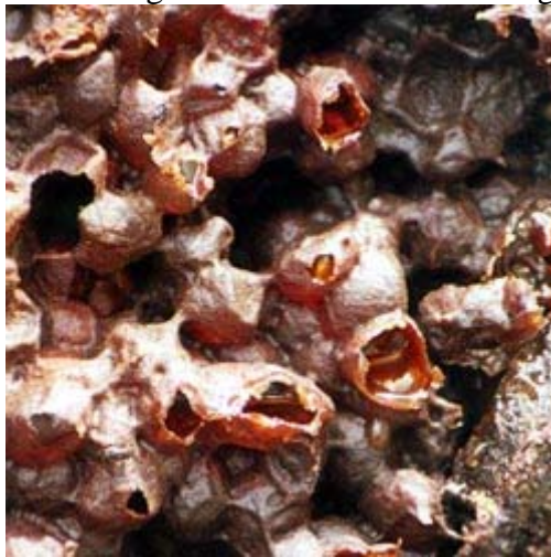
[ Trigona honey pots]

would you believe? Ten of these species are known to be social as opposed to being solitary, that is to say, they function in colonies with a queen bee, drones and workers as does the European bee. Of these 10 species, 3 of them are being domesticated by beekeepers ( Trigona Carbonaria , Trigona Hockingsii and Austroplebeia Australis ). They have been domesticated in the sense that hives have been designed and purpose built for the bees and the stingless bees (also known as meliponines) go out to 'work' for the farmer by pollinating trees like the macadamia as well as gathering a small amount of honey. This honey produced is only 1-2% of what the regular commercial bees produce but I think what it may lack in quantity would be made up by its medicinal and other qualities. In Central America stingless beekeeping has been cultivated to a high degree for centuries. The bees have been part of the Australian culture for thousands of years and the indigenous peoples of this great land had a mutual cooperation with the bees without radically changing their housing i.e. taken them out of the natural environment. The mutual cooperation came about through indigenous peoples obtaining 'sugarbag' and resinous materials and the bees being the recipients of forces of healing and continuance from song and ritual ceremony.