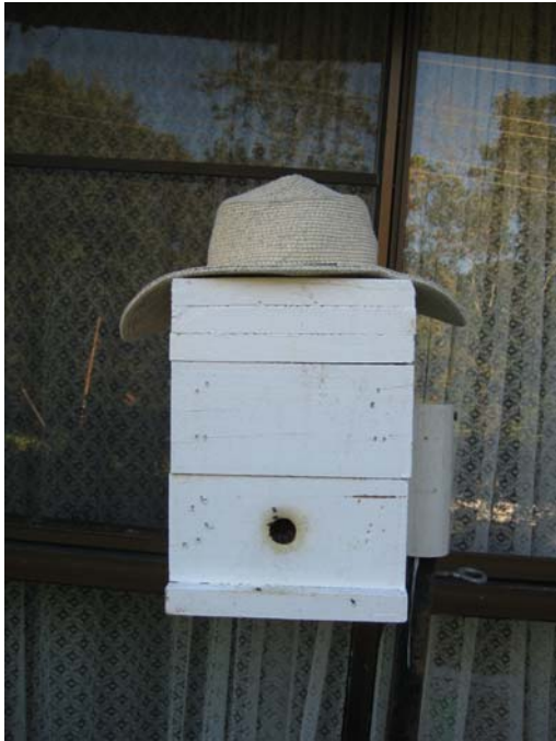
[photos of my hive outside my office – the hive design is an OATH Original Australian Trigona Hive]