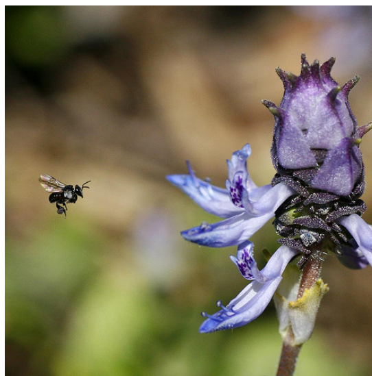
[Trigona beelining towards blossom]

They are so small these creatures, like little black ants with wings – they really are quite endearing the trigona carbonaria. You can put your finger on the hive entrance and the little fellas do not try to bite you and cannot sting you as they are stingless. Quite a different experience from my times with apis mellifera, the ‘European’ honey bee whose tongue is longer than the trigona’s whole body! The name trigona carbonaria is quite a mouthful initially but when you realise that trigon is another word for triangle and carbon is black it starts to come together. However “trigona” was chosen by Jurine in 1807 and “carbonaria” was named by Smith. Both have since died and there does not seem to be a record of the reason behind the namings.