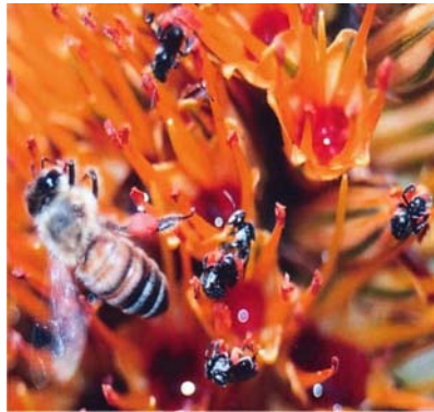
[Apis mellifera and Trigona Carbonaria feeding]

They are so small these creatures, like little black ants with wings – they really are quite endearing the trigona carbonaria. You can put your finger on the hive entrance and the little fellas do not try to bite you and cannot sting you as they are stingless. Quite a different experience from my times with apis mellifera, the ‘European’ honey bee whose tongue is longer than the trigona’s whole body! The name trigona carbonaria is quite a mouthful initially but when you realise that trigon is another word for triangle and carbon is black it starts to come together. However “trigona” was chosen by Jurine in 1807 and “carbonaria” was named by Smith. Both have since died and there does not seem to be a record of the reason behind the namings.