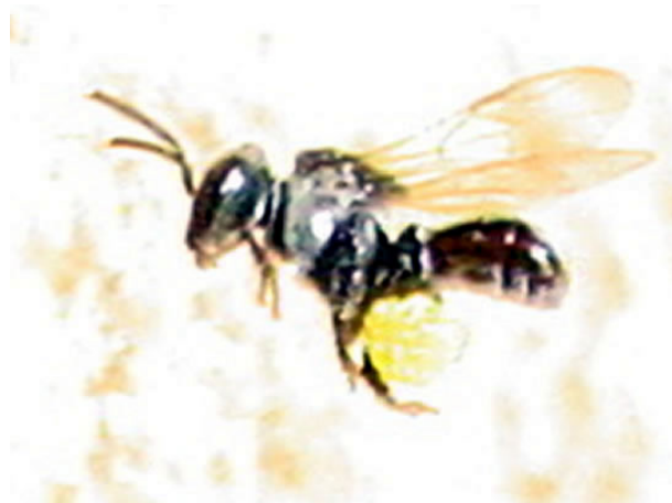
[ Trigona carrying pollen]