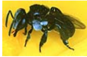
[Australian Indigenous Social Bee Trigona Carbonaria]